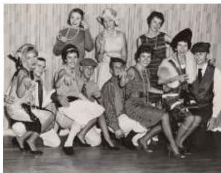
“The Roarin’ 20’s” Party—60’s