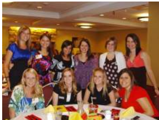
Recent graduates and members of EKAC

Keep your membership current by paying support fees. The fees help us operate as a chapter and fund efforts to support our Collegiate sisters.