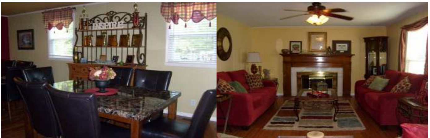
New dining tables from Parents Club and new hardwood floors in Formal Room from HA. Visit the alumnae chapter website to see more photos of the work completed this summer and information about future projects www.agdpsualum.com