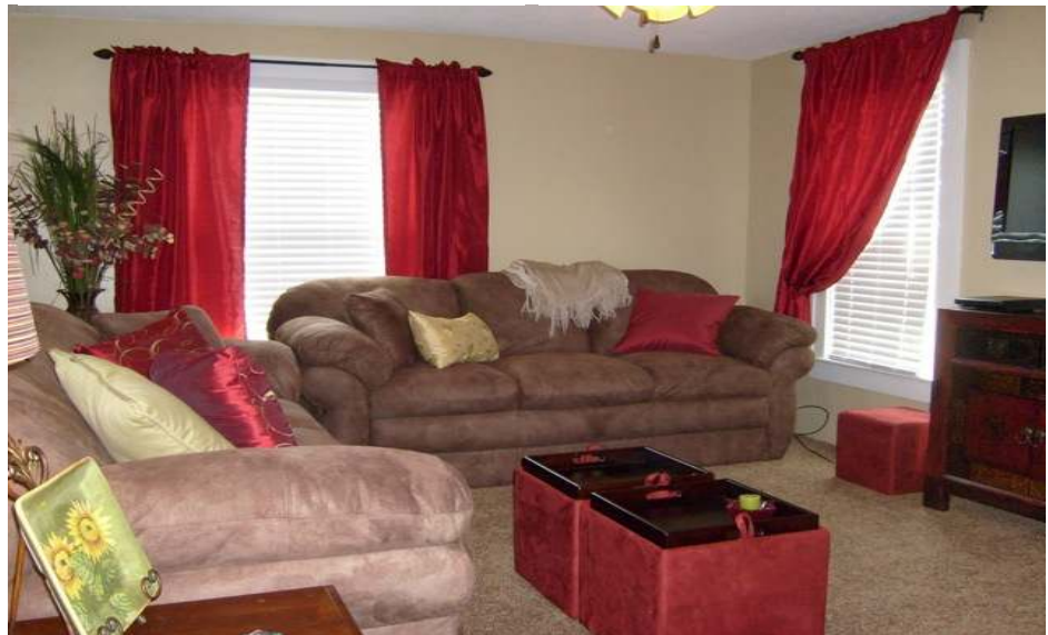
New TV Room Furniture from Parent’s Club and Carpet from HA