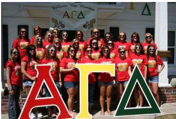
EK new members donning matching sunglasses and t-shirts with the phrase "Welcome to the Good Life"

Polish Week (Work Week) started August 9 th for our collegiate sisters. They were able to build sisterhood while preparing for formal recruitment. They practiced songs and conversation and rehearsed House Tours, Sisterhood Night, Philanthropy Night, and Preference. EK's Recruitment Specialist visited the chapter during Polish Week. She stated, "I was very impressed with the chapter's preparation. These are sharp girls who want to be very successful. Participation was whole-hearted and lots of women contributed with questions and suggestions. The house looks wonderful and they are obviously so proud of it."