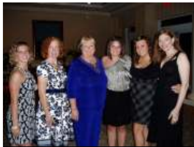
Feast of Roses—Convention 2010

The theme at Convention this year was Navigating with Purpose, and there were several activities involved around incorporating the principles of Alpha Gamma Delta Purpose into our actions. I want to encourage you to get involved with the alumnae chapter this year as we deepen our bonds of sisterhood and as we support the collegiate chapter. One of our Convention activities was an Alpha Gamma Delta Passport, which contained challenges relating to each element of the Purpose. I'd like to incorporate that idea into EKAC, and I present the following challenges for the upcoming year: