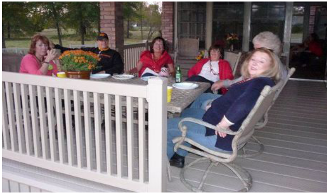
Homecoming After Party 2010