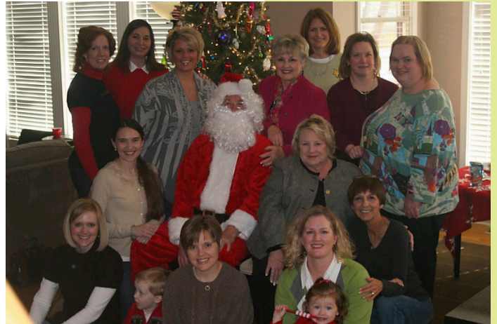
Alumnae Christmas Party 2010

The Alumnae Chapter looks forward to seeing these scholarships awarded once again and to reporting progress in the next edition of the Nutty News.