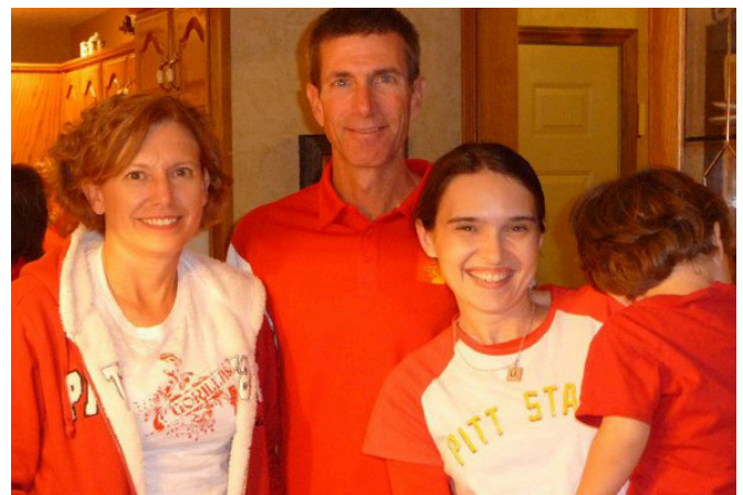
Homecoming After Party 2010