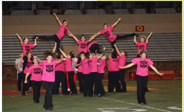
Yell Like Hell Performance 2010