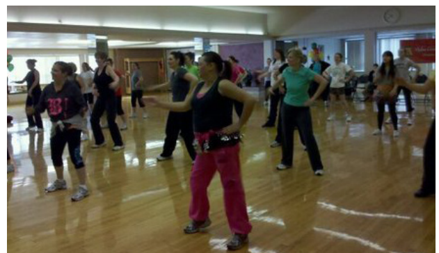
Zumba Fundraiser 2011