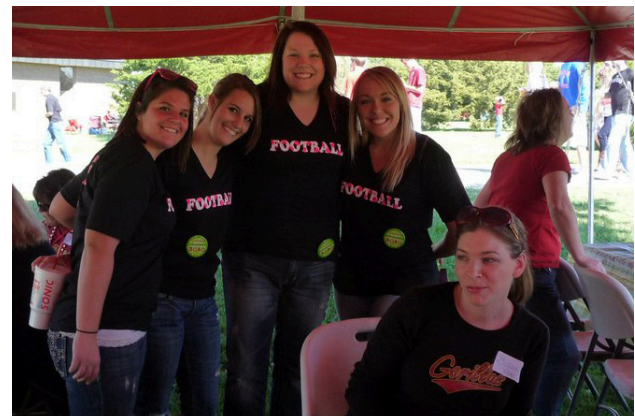
Homecoming Tailgate 2010