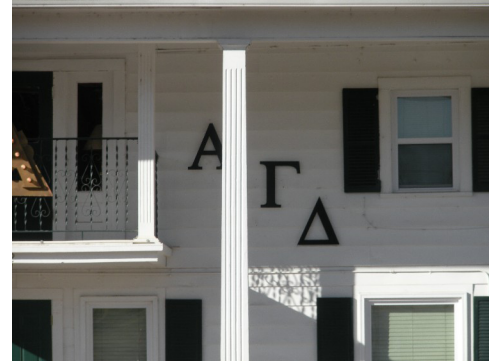
New Greek Letters

I am sure many of you are thinking that is all great, but what about the addition! We are still working toward plans for an addition. A sub-committee of the HA Board, along with an architect and engineering firm, have recently completed the parking lot site plan, floor plans for the upper and lower additions, and cost estimate for all. I will be unveiling those at the House Association Annual Meeting on April 16 immediately following IRD. If you have never been excited to attend an HA Annual Meeting, then you should get excited for this one. If you will not be able to make the HA Meeting, don't