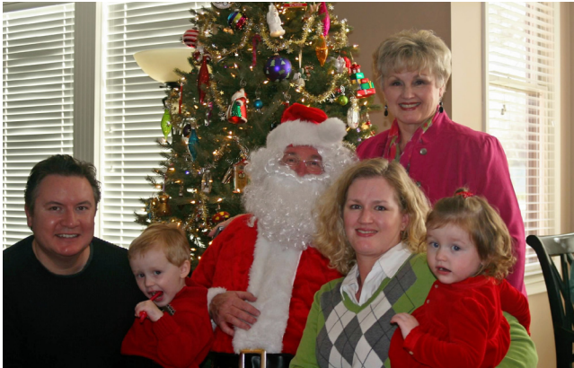
Christmas Party 2010