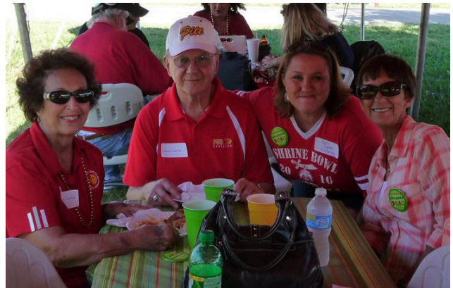
Homecoming Tailgate 2010

We will be recognizing our sisters that were initiated in 1961 and 1986 during Award Ceremonies at IRD. If you were initiated in one of these two years, we would love for you to attend IRD and be honored.