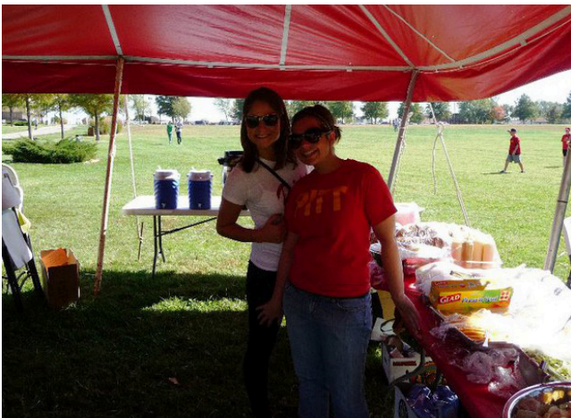
Homecoming Tailgate 2010